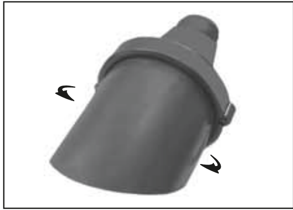
3. Adjustable Shield can be adjusted 360° when fixture is in down position. Tighten screws.

2. Replace with new Full or Adjustable Shield. Drain hole in shield must face down when fixture is in up position. Tighten screws.