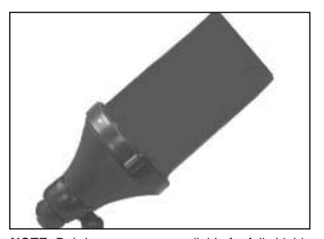
NOTE: Debris screens are available for full shields by ordering catalog no. DS71, DS72, DS73, DS74